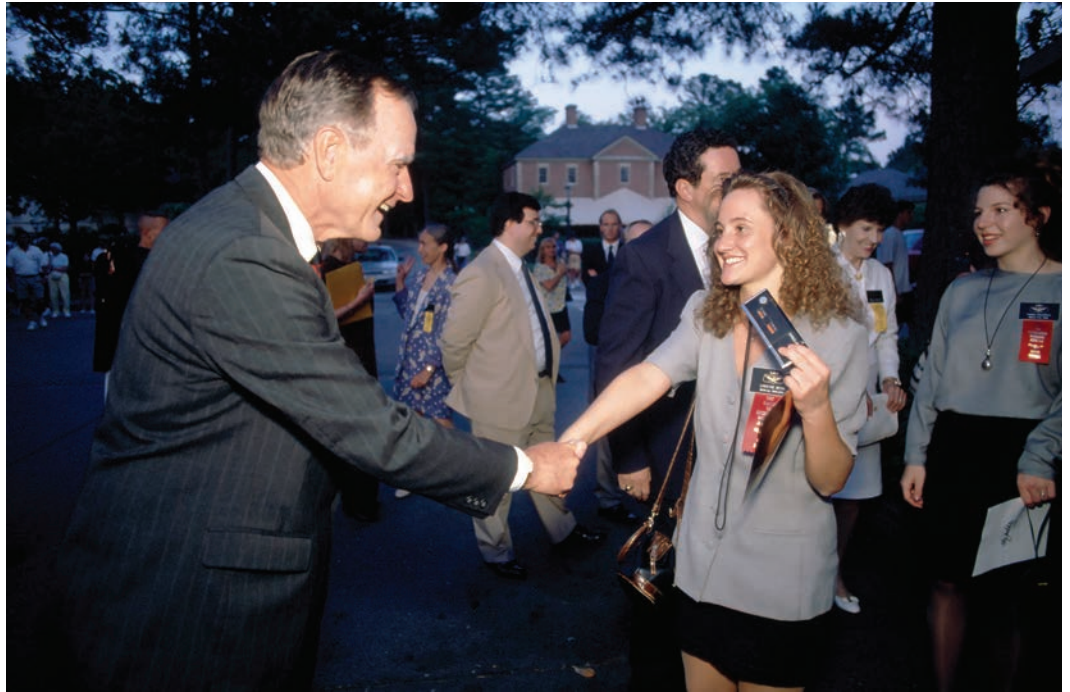
President George H.W. Bush, Golden Plate awardee, meets delegates at the 1995 Summit in Colonial Williamsburg.

In this spirit, the Academy has established the International Achievement Summit, as well as programs such as Achievement TV and the Museum of Achievement, located in Washington, D.C. The biographies, interviews, symposiums, podcasts, and photographs presented on the Academy's website, www.achievement.org , have been compiled from the Academy of Achievement's exclusive collection of interviews. The Academy has developed a comprehensive video archive of historical figures, weaving their stories into a unique narrative history of our world. While we believe that everyone can benefit by exploring the lives of these extraordinary leaders, visionaries, and pioneers, we encourage students in particular to draw on these materials while forming their own judgments and values. We encourage all to study these unique figures from our common heritage, and to discover how their inspirational life stories can be used to create roadmaps to our own successful destinations.