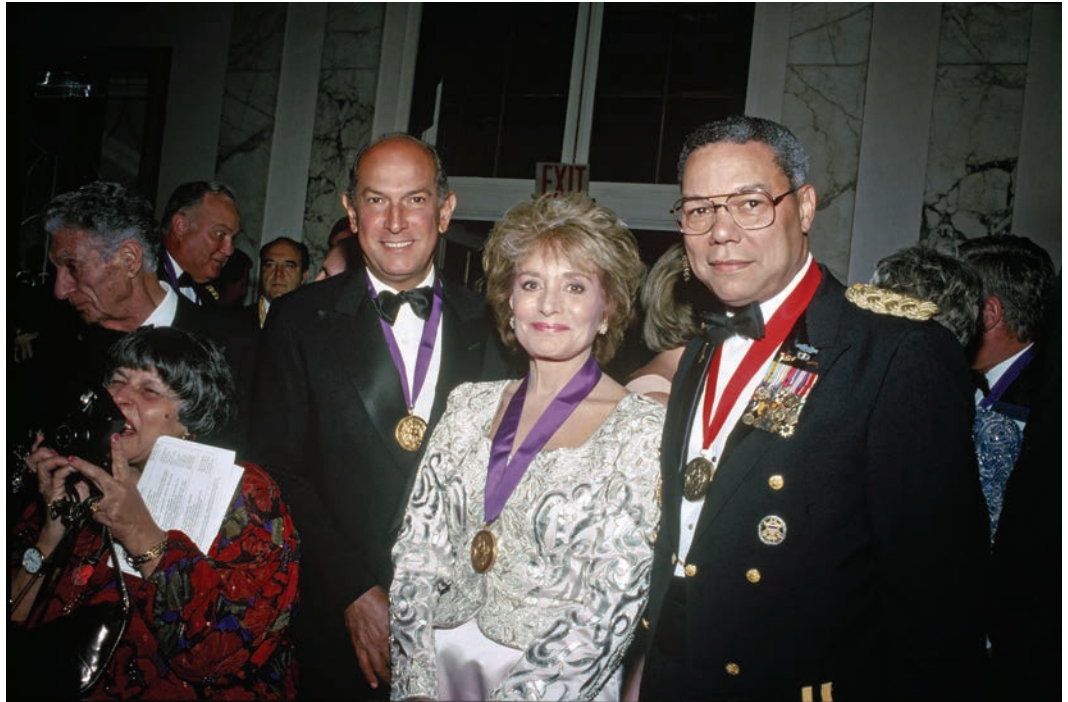
Awards Council member General Colin L. Powell at the 1991 Banquet of the Golden Plate ceremonies in New York City with Academy of Achievement inductees: fashion designer Oscar de la Renta and journalist Barbara Walters.