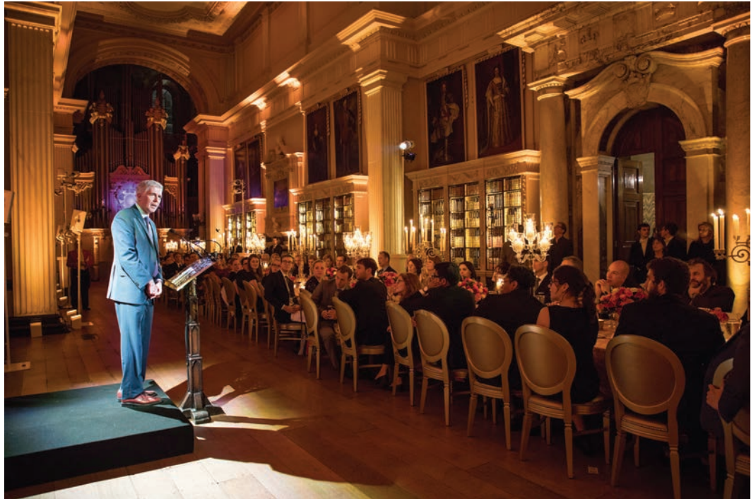
Neil M. Gorsuch, Justice of the Supreme Court of the United States, addresses Academy members and Marshall Scholars at historic Blenheim Palace in Oxfordshire, England, during the 2017 International Achievement Summit.

The lives of legendary achievers have endlessly fascinated the public. We marvel at George Washington's selfless commitment to his country, Thomas Edison's vision, Helen Keller's courage. Such heights, young people often believe, could only have been scaled by someone of unparalleled genius, or persons born to privilege, or those favored by sheer luck. However, the lives and words of these heroes reveal a different story. Few were born rich. They were no more lucky or unlucky than their contemporaries. They were individuals like us, beset by the same challenges that human beings have faced throughout the ages. Their greatness lies not in accidents of birth or good fortune, but in how they met and overcame the extraordinary challenges they faced in their own lives.