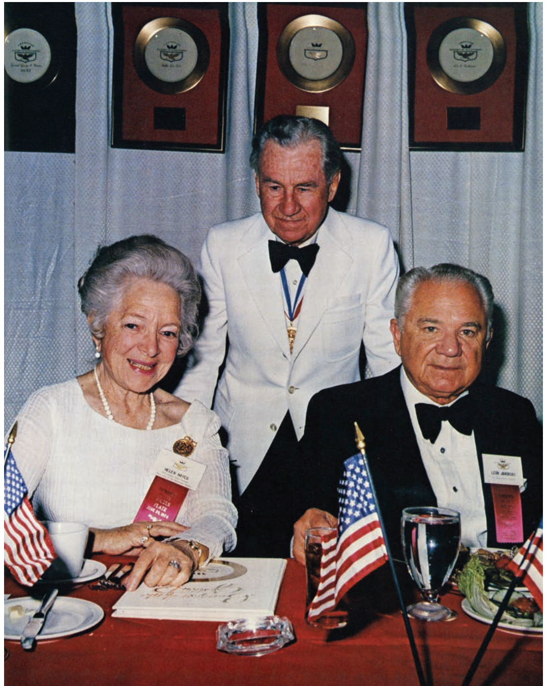
Members of the Awards Council: award-winning actress Helen Hayes, pioneer TV newscaster Lowell Thomas, and famed attorney Leon Jaworski at the 1974 Banquet of the Golden Plate Award ceremonies in Salt Lake City, Utah.

In 2011, the Academy of Achievement published a library of more than 500 exclusive audio and video symposium presentations from its annual Summits on iTunes U. The Academy has continued to add to this collection, which now spans more than 30 years, from 1981 to 2017. Academy of Achievement podcasts are available to the public on iTunes U, free of charge, under the Creative Commons License. In 2015, the Academy launched a podcast series, What It Takes , on iTunes. The podcast presents the life stories and reflections of Academy members who have had a huge impact on the world, and insights you can apply to your own life. What It Takes has received millions of downloads on Apple Podcasts.