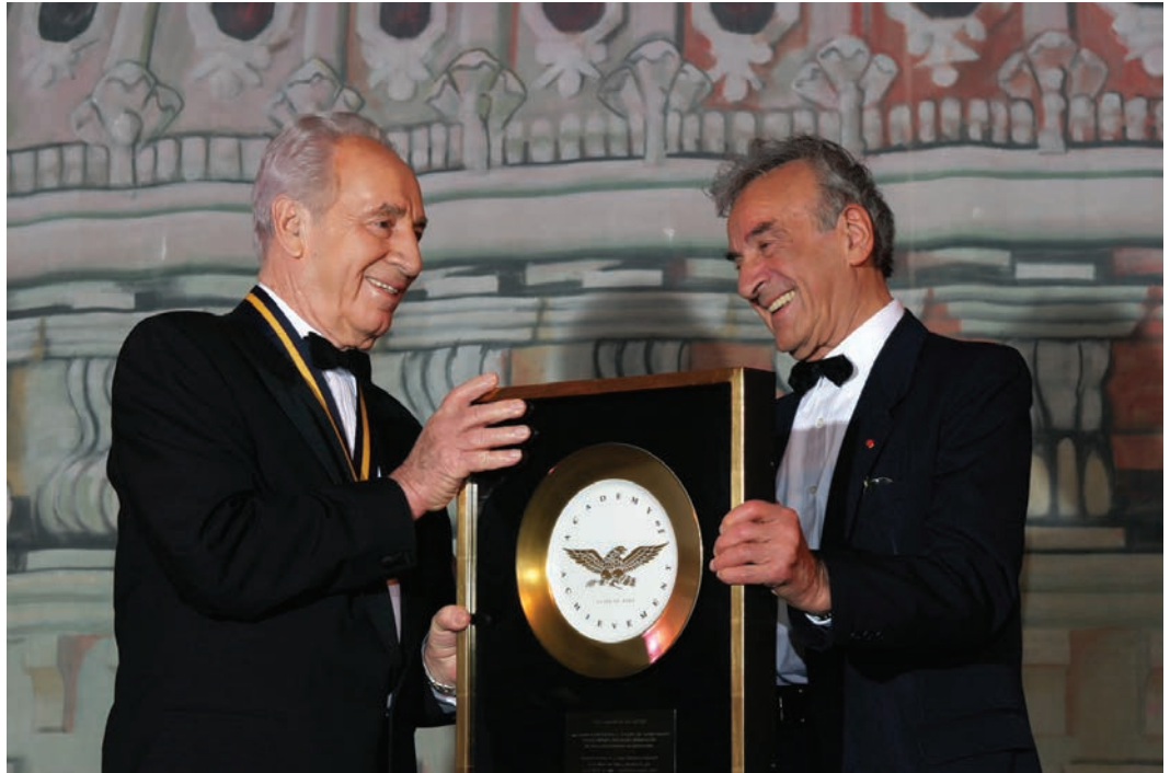
Awards Council member and Nobel Peace Prize laureate Dr. Elie Wiesel presents the Academy of Achievement's Golden Plate Award to Shimon Peres at 2003 International Achievement Summit ceremony in Washington, D.C.

A sense of electricity grows throughout the program, as the delegates — through direct personal contact with past and present Academy honorees — are reminded of the shared history of human progress, and of the common heritage of individual leadership and initiative, which know no national boundaries. Similarly, the honorees draw inspiration from the promise represented by the young delegates. Generational and cultural barriers fade away as participants join in the spirit of the occasion, a celebration of the individual's power to shape our world.