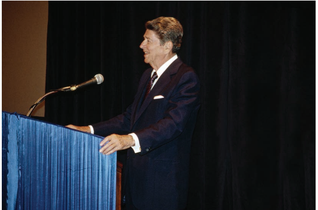
President Ronald W. Reagan addressing the Academy of Achievement delegates at the 1990 Summit in Chicago.

Since 1961, these generation-spanning forums have allowed exceptional young scholars to interact one-on-one with Pulitzer and Nobel Prize-winners in the arts and sciences, public servants, explorers, humanitarians, champion athletes, entrepreneurs, entertainers, and countless others who represent achievement in their respective fields. Such personal encounters send an enormously powerful message to young people raised in a world that so often values the superficial and ephemeral over the monumental and enduring.