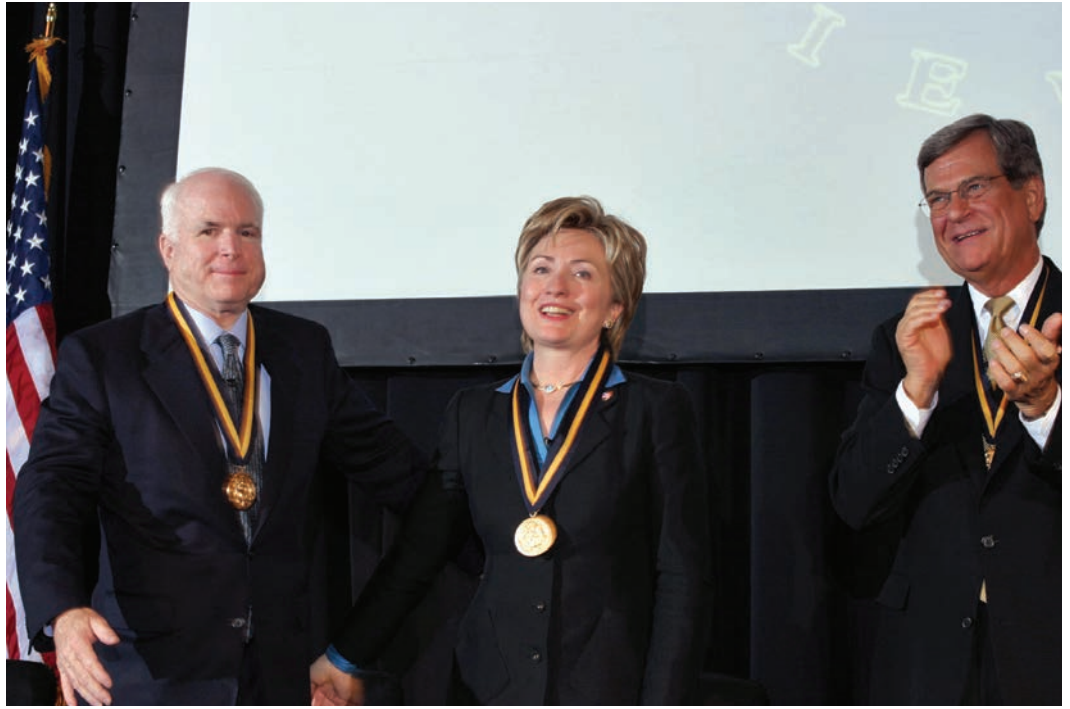
U.S. Senators John McCain, Hillary Clinton and Trent Lott receive their Academy Gold Medals at the 2003 Summit.

The Academy is a nonprofit organization within the meaning of Section 501(c)(3) of the U.S. Internal Revenue Code. All contributions to the Endowment Fund and to the Academy itself are tax-deductible under federal law.