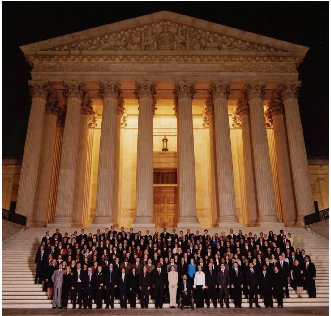
2003: International student delegates of the American Academy of Achievement at United States Supreme Court after a dinner hosted by Awards Council members Justice Sandra Day O'Connor and Justice Ruth Bader Ginsburg.

The outstanding scholars, scientists and social entrepreneurs selected to attend the International Achievement Summit are chosen from among the most distinguished young people in the world. The graduate student attendees are selected through a roster of prestigious international fellowship and scholarship programs, such as the Howard Hughes Medical Institute's Medical Research Fellowship, the Rhodes Scholarship Trust, the Truman Scholarship Foundation, White House Fellows Program, the Paul and Daisy Soros Foundation Fellowship, the Marshall Scholarship, Gates Cambridge Fellowship, and the Catherine B. Reynolds Foundation Fellowship Program for Social Entrepreneurship. The faculty of colleges and universities around the world also nominate student delegates for the International Achievement Summit. The student delegates have distinguished themselves not only in their academic or artistic pursuits, but also in their record of service to their schools and communities as well as to various international charitable organizations. Their interests span the full spectrum, from the sciences to law, medicine, the humanities and entrepreneurship. In addition, the Academy of Achievement invites several student delegates who have demonstrated great promise in the performing arts to participate in the Summit activities.