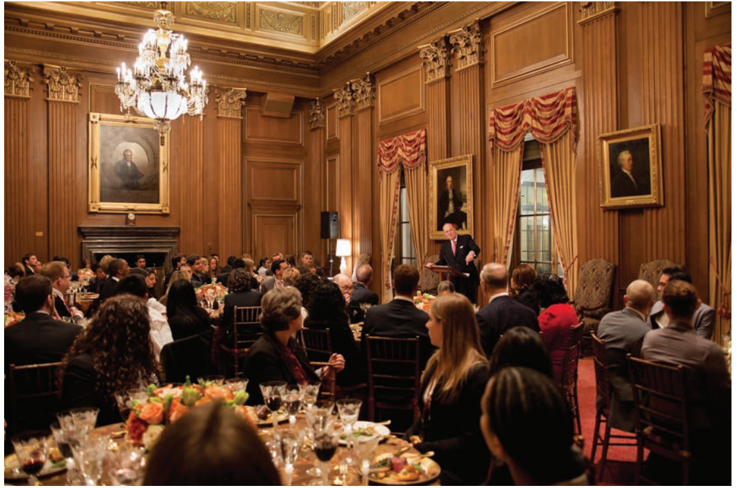
Awards Council member Justice Anthony Kennedy addresses the American Academy of Achievement delegates at the United States Supreme Court during the introductory dinner of the 2012 International Achievement Summit.