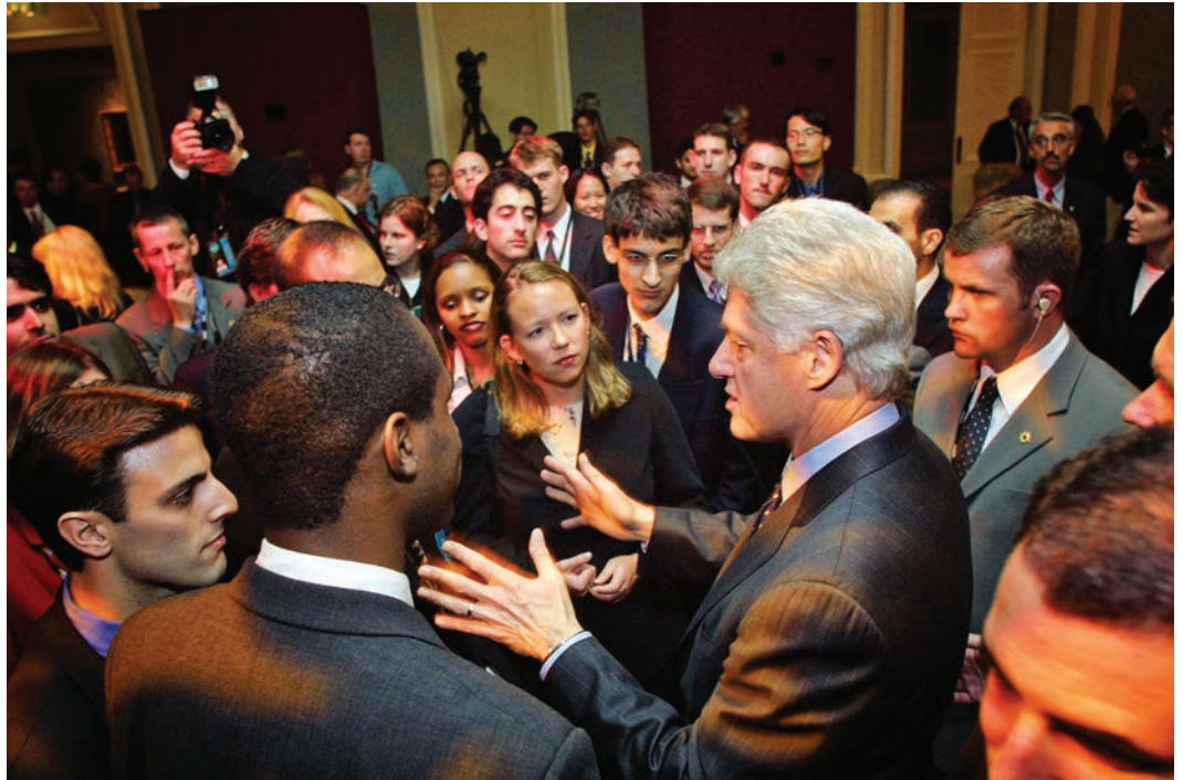
President Bill Clinton speaking to the Academy delegates at the 2002 International Achievement Summit in Dublin.

The Academy's annual gatherings transfer knowledge, inspiration and the benefit of extraordinary life history from one generation of established achievers to the next generation of young people, who will in turn become leaders in their respective fields.