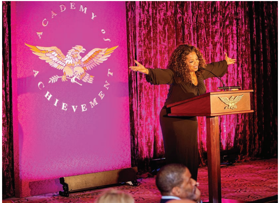
2014: Golden Plate Awards Council member and 1989 Academy guest of honor Oprah Winfrey introducing legend of American cinema, Sidney Poitier, at an American Academy of Achievement ceremony in Los Angeles, California.

The following is a partial list of Golden Plate honorees. These visionaries and pioneers — whose ideas and talents have influenced the world — have all participated in the annual International Achievement Summit and addressed the student delegates. They are listed with the year of their induction into the Academy. A more comprehensive Summary of Golden Plate recipients, grouped by decade and field of endeavor, is also available.