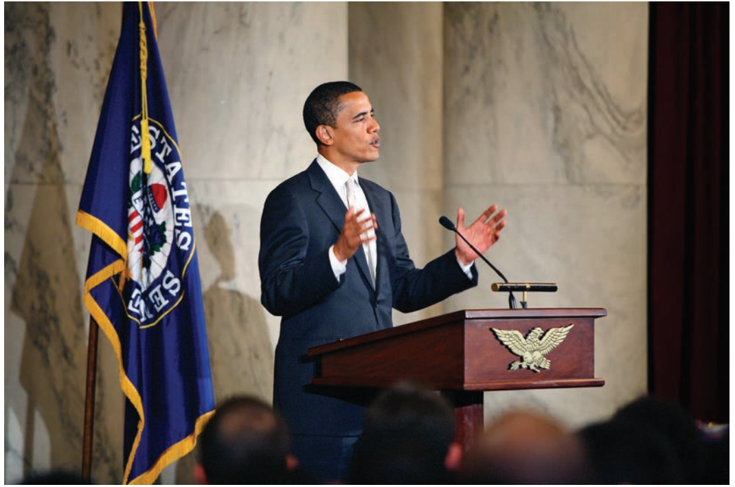
President Barack Obama addressing the delegates at the 46th annual Achievement Summit in Washington, D.C.

The Academy of Achievement held its first annual International Achievement Summit in 1999. The forum gives exceptional scholars from around the world the opportunity to interact with preminent achievers. The Academy invites leaders in diverse fields of endeavor to attend the Summit and participate in a series of symposiums and roundtable discussions. Approximately 80 men and women — 50 distinguished previous awardees and 30 new honorees — interact with 100 delegates — graduate students, research fellows, scholars, young scientists, physicians and social entrepreneurs — over the course of several days in an informal setting.