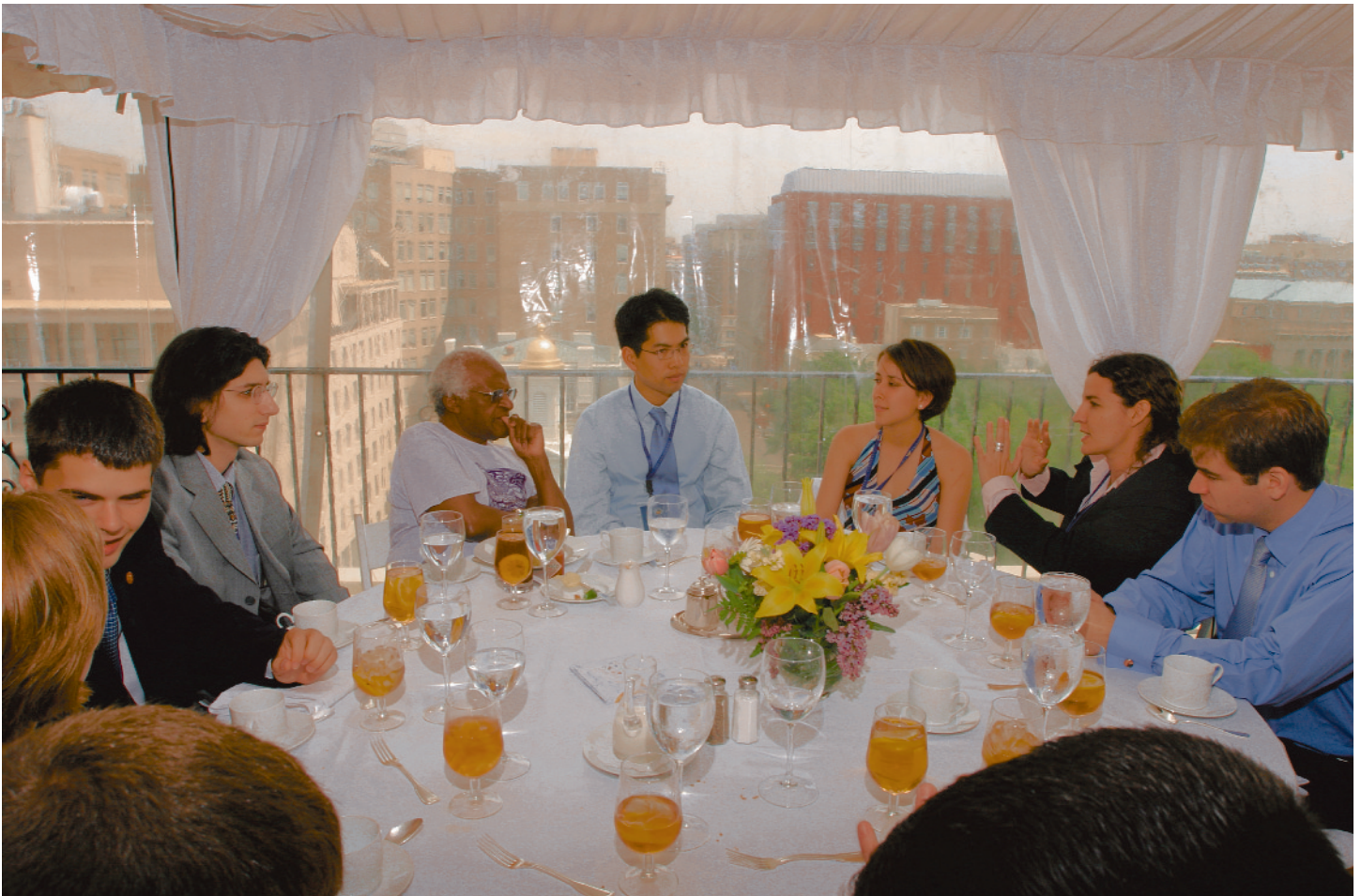
Archbishop Desmond Tutu, recipient of the Nobel Prize for Peace, joins Academy Student Delegates for an informal lunch at the International Achievement Summit in Washington.