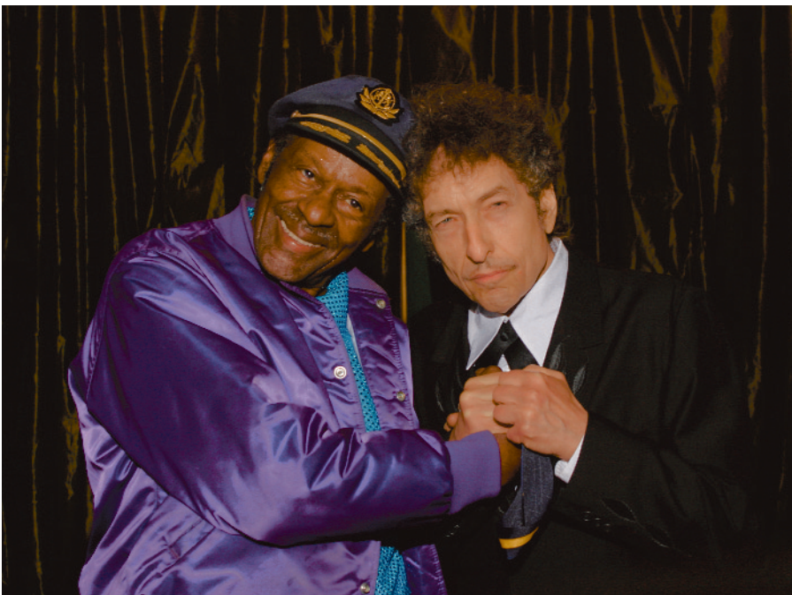
Rock and Roll pioneer Chuck Berry helps honor legendary musician Bob Dylan at the 2003 International Achievement Summit.

On that extraordinary tableau, and with the sounds of classic American rhythm and blues ringing in their ears, Academy members, guests, and International Honor Students departed, carrying unforgettable memories of their visit to Washington. Many will return before long as leaders in public service and representatives of their respective countries, but all will proceed with renewed inspiration, having seen and heard firsthand that in every walk of life, one individual can make a difference.